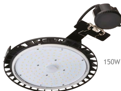
150W with sensor